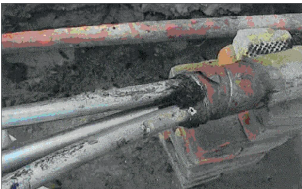
Corrosion on the outer sheath and the building of holes in the lead sheath

Due to lead sheath corrosion, oil leakage and the decomposition of the cellulose chains through ageing, the moisture content of the insulation increases. This reduces the object's residual breakdown strength until the remaining value is close to the nominal operating voltage and cable operation becomes too risky. The lifetime of the cables in general strongly depends on the manufacturing quality, as well as laying and service conditions.